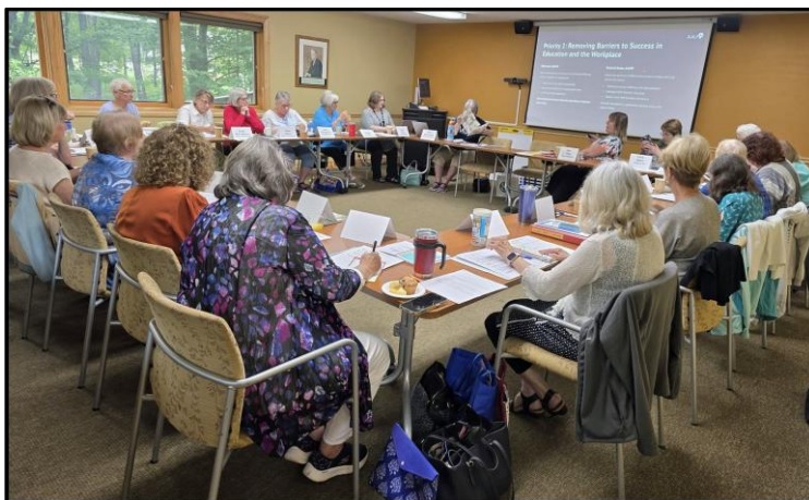
State Board at work