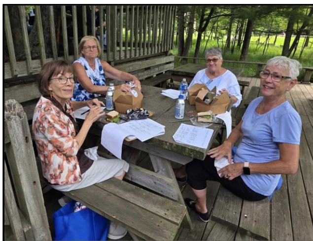
Group work at the board meeting. Lunch too!