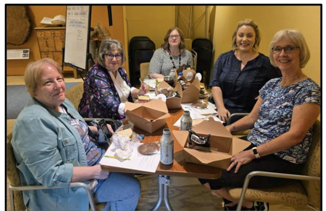
Group work and lunch